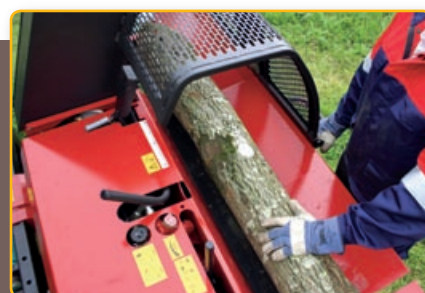
Functional design: Clear-cut design and straight lines make operation easy-to-follow, user-friendly, and safe. The protective covers are designed to provide ample space for large and/or bent logs.