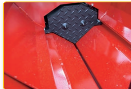
5.0 and 8.0 ton splitting power: Great power and short splitting cycle makes the machine very effective. The splitting cycle is only 2.7 sec.