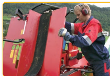
Easy access to maintenance: Easy accessible during filing and other maintenance. Service can be carried out in an upright position.