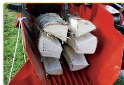
Different splitting knives: DALEN 2054 is delivered with a 4-way splitting knife. 6-, 8- and 10-way knives can be delivered additionally. All knives are designed to open the log in several levels.